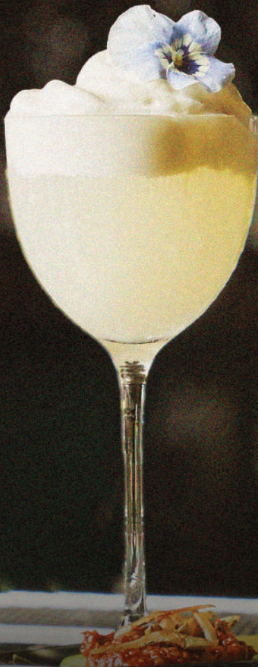
SIP Gentle Indulgence