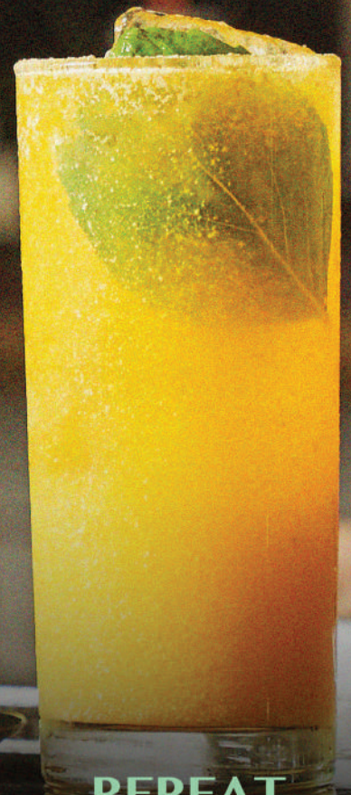
REPEAT Effortless Enjoyment